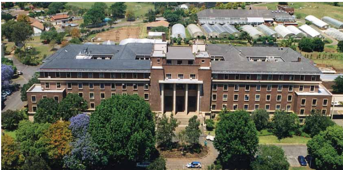
Aerial view of Agriculture Building, Pietermaritzburg.