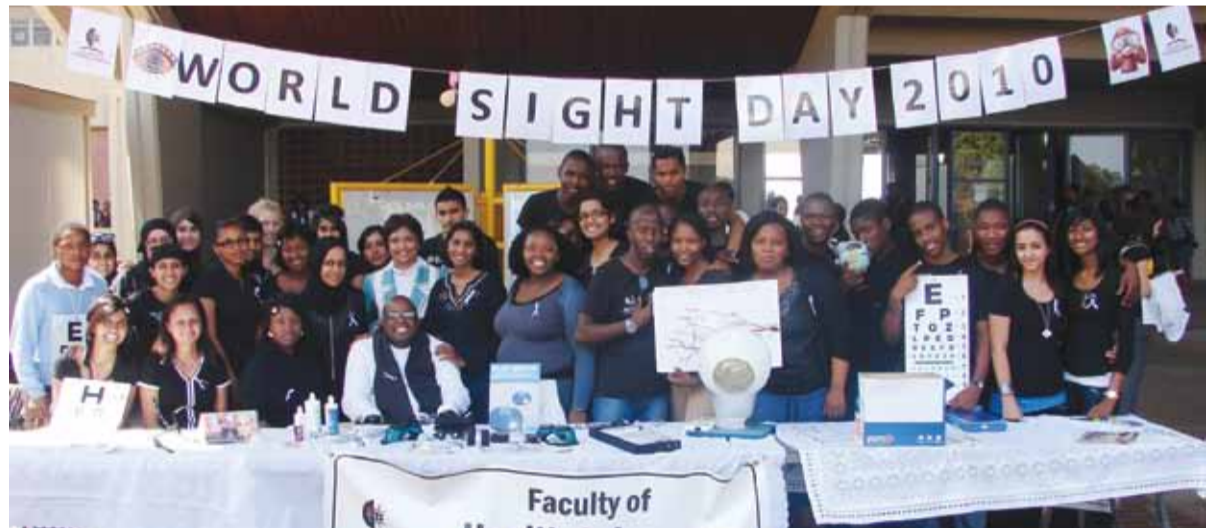
Students and Staff from the Discipline of Optometry commemorate World Sight Day on the Westville campus.